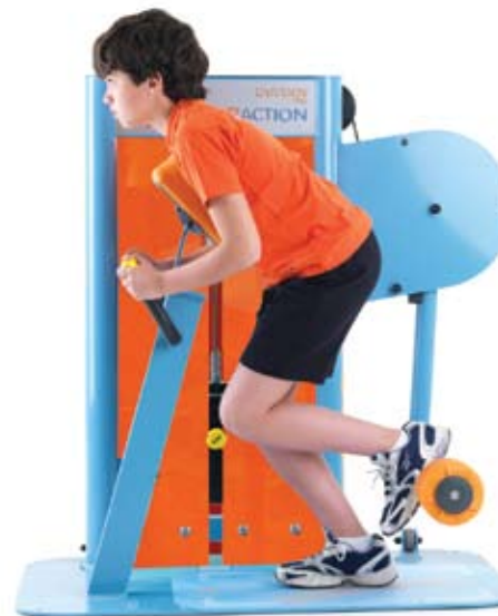
GB 320 - IT IS ALL FOR YOU